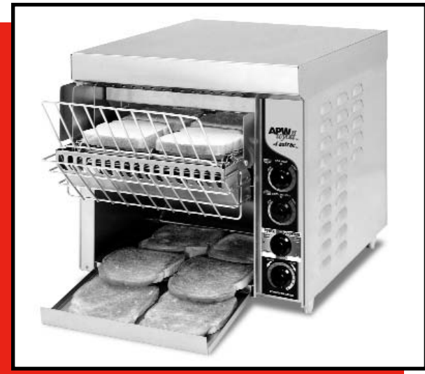
MODEL FT-1000 RADIANT CONVEYOR TOASTER